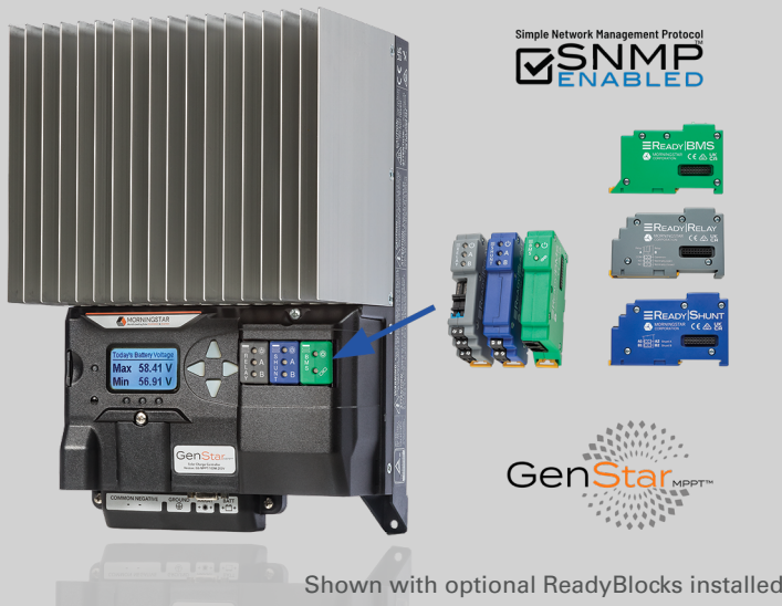
Shown with optional ReadyBlocks installed